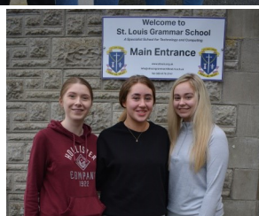
AS Success at St. Louis