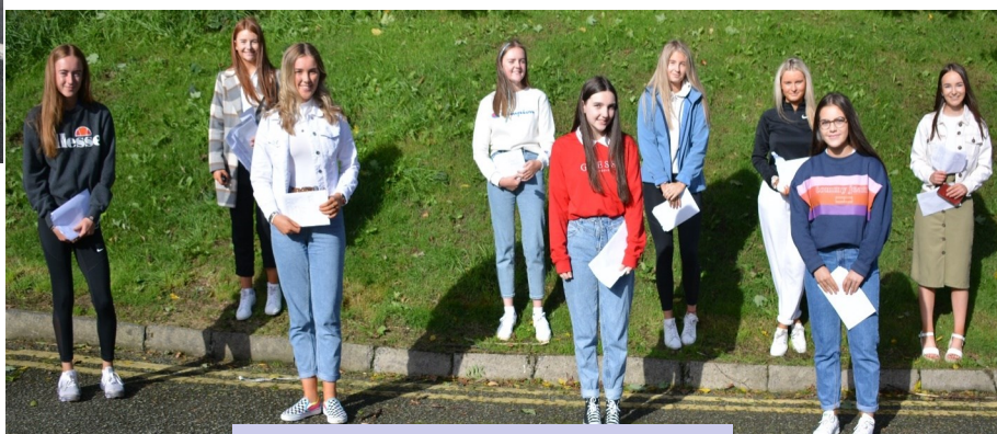
GCSE Success at St. Louis

The current Year 14 and Year 12 students have yet to face the examinations they have worked so tirelessly towards. In light of the cancellation of examinations in 2020, few would have thought this situation would be replicated in 2021. However, both our current A2 and GCSE students have embraced the uncertainty of the future with greater focus to ensure the continuation of their studies and the generation of the evidence that may be needed for the awarding of grades in 2021.