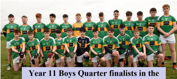
Year 11 Boys Quarter finalists in the Paddy O’Hara Cup