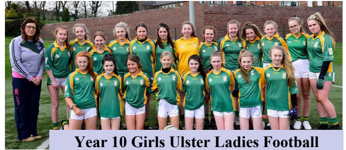
Year 10 Girls Ulster Ladies Football Quarter finalists