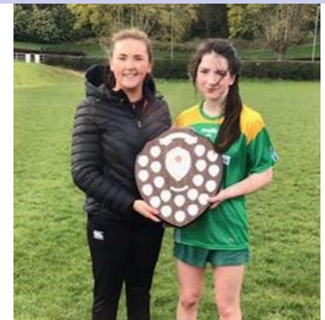
Junior ‘Camogs’ lift Down Shield Title in Castlewellan

However, the Global Pandemic put all aspects of life on hold, including our participation in Ulster Schools Gaelic sports. We look forward to the end of this pandemic and competing once again against other schools for Ulster titles. We also look forward to the wonderful experiences that come with team sport and in particular, playing as teammates on St. Louis teams.