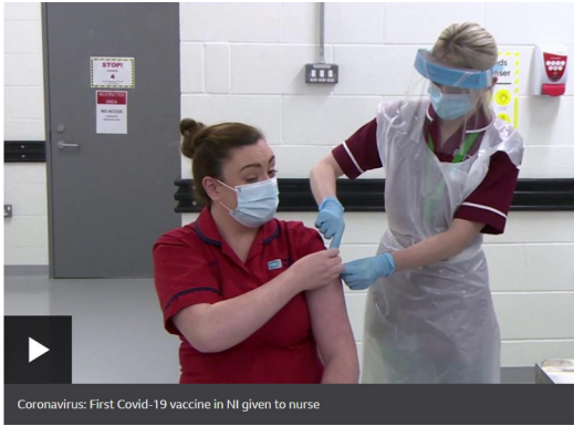
Coronavirus: First Covid-19 vaccine in NI given to nurse